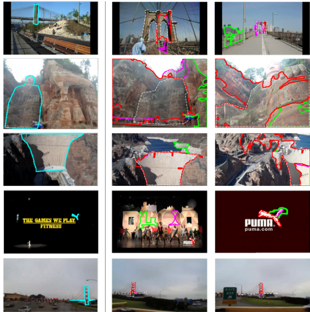
Figure 4. Segmented object retrieval. On the left of the gray line we have the query image with the user-specified object of interest. On the right the top two retrieved results, with the top three estimates for the regions of interest. The white striped lines denote the ground truth. Although only a single query example is used, we can identify the segmented object of interest. This is especially noteworthy for the Brooklyn Bridge (top row), where the segmented query is viewed sideways and the retrieved segments are photographed from a frontal view and varying distances.

We use the feature encoding of the segmented query as a classifier function. For retrieval, the cosine similarity is measured by a dot product between the \ell_2 normalized query