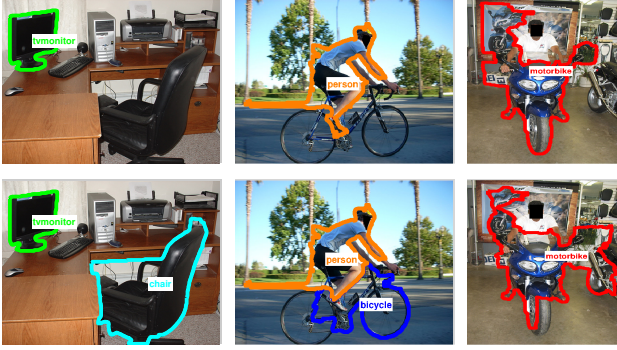
Figure 3. Semantic segmentation. Adding normalized Fisher codemaps (bottom row) on top of the CPMC-O 2 P [5] (top row) appears to be beneficial when multiple objects appear simultaneously in the image. Note for example the difficult case in the last column, where codemaps help better segmenting the motorbike on the poster and the motorbike in the right part of the image.