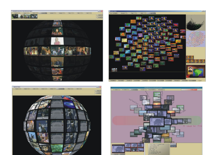
Fig. 2. Browsers in the MediaMill search engine. Top left the CrossBrowser (showing a ranked query result vertically and the timeline of the program horizontally), bottom left the SphereBrowser (with a tennis thread in the center), top right the GalaxyBrowser (several clusters of different maps visible) and bottom right the RotorBrowser (showing several threads containing the current shot).

We performed our experiments within the interactive search task of the 2005 and 2006 NIST TRECVID benchmark, due to space limitations we only show results for 2006 here, for